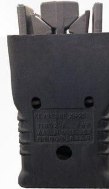
Keystone K 25 K 250 K 2500