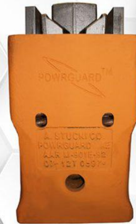
Stucki PowRGuard™ XE PowRGuard™ GXE PowRGuard™ GX