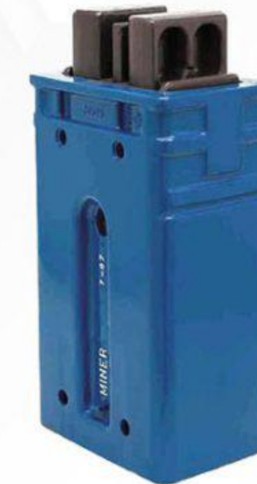
Miner Crown SE