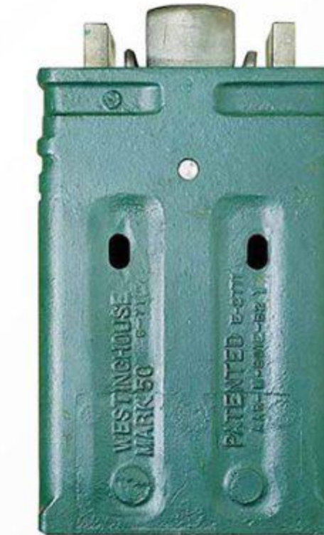
Cardwell Westinghouse Mark 50 R500