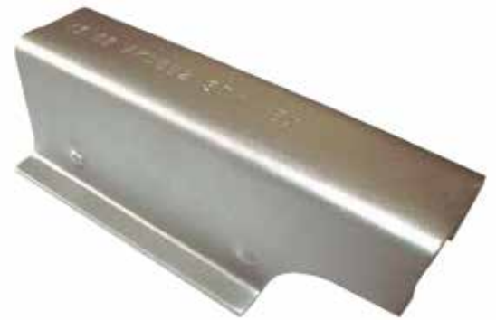
Part No. : ASC-1696